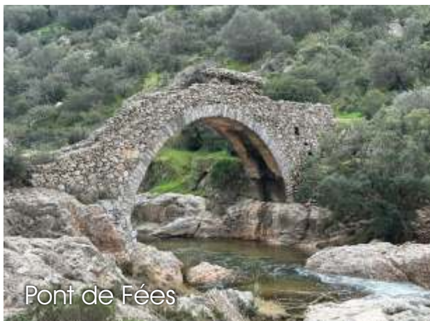
Pont de Fées

The Pont de Fées and the windmill Saint Roche