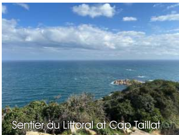
Sentier du Littoral at Cap Taillat