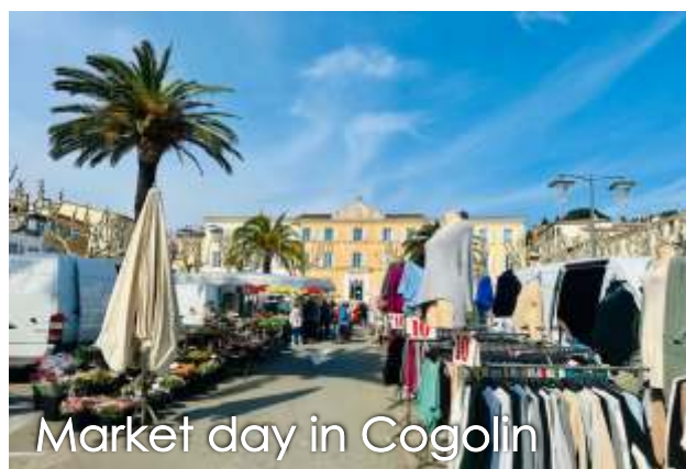
Market day in Cogolin