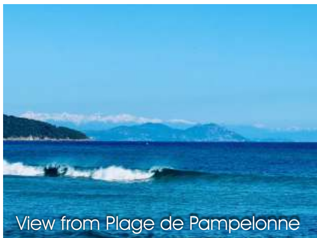
View from Plage de Pampelonne